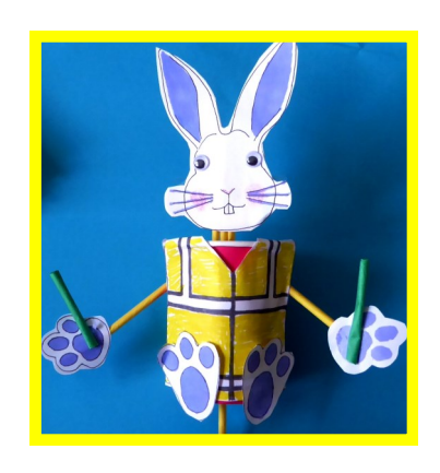
The cup should look like this